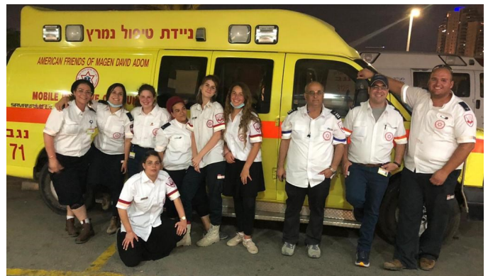
You can help provide critical medical care for the brave pioneering families of Telem and Adorah!