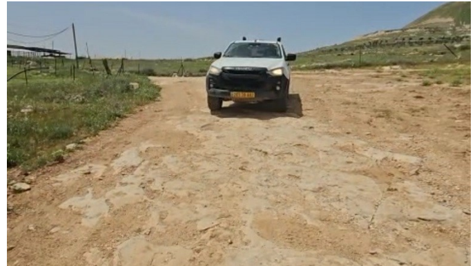
The deteriorated perimeter security road leaves the families of Sde Bar vulnerable to hostile infiltrations