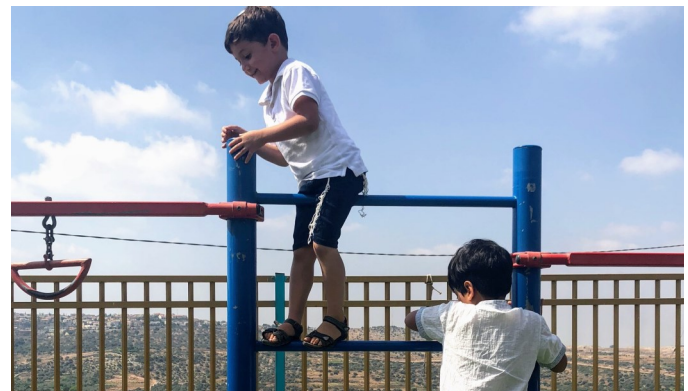
You can help keep these innocent children in Zufim safe from terrorist threat