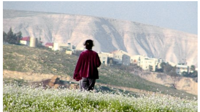
Without a complete surveillance system, the community of Alon is extremely vulnerable to terrorist attacks