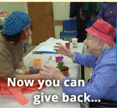
Now you can give back...