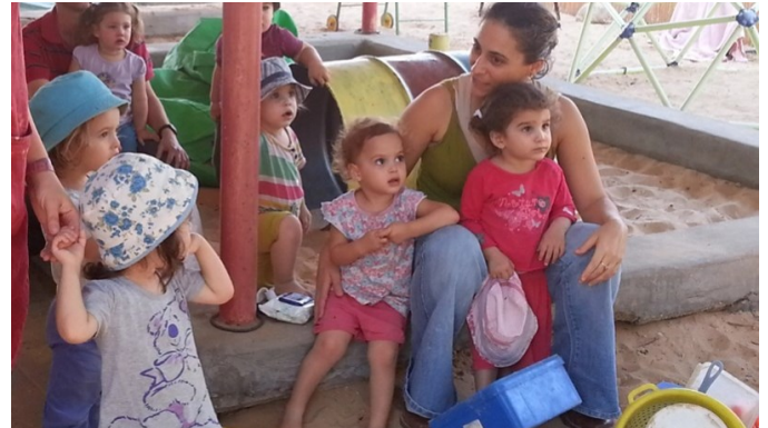
It is vital that the young children in Bet Yatir have a safe and well furnished Daycare Center close to home