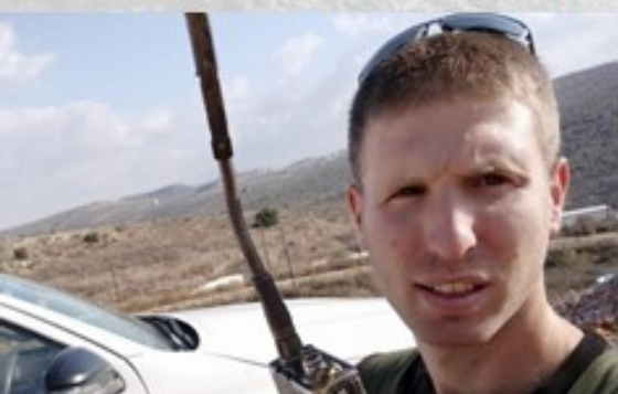
Volunteer rapid responders in Judea and Samaria rely heavily on special radio communications in the mountainous terrain.

How could he protect them – his neighbors, his community, his friends, his family – without eyes?