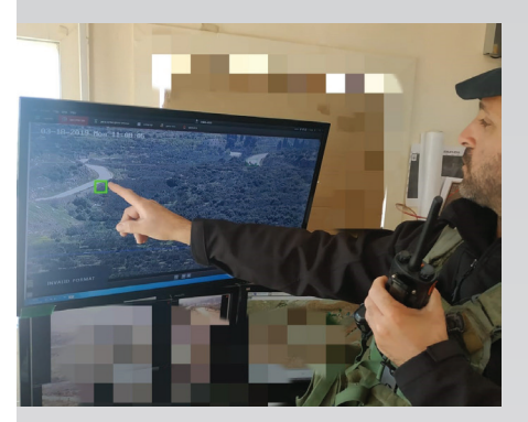
The spot where Rechalim's security forces halted the attempted infiltration

God frequently works through messengers, and thanks to you, CFOIC Heartland has been able to fill the role of God's lifesaving messenger many times over