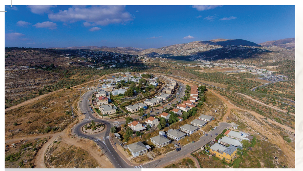
The beautiful community of